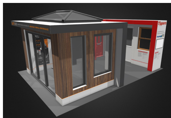
Tippers 3D design concepts

The modern showroom contains an extensive collection of PVC-U casement windows, vertical sliding sash windows, composite doors, aluminium windows,